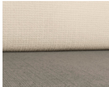
+ Upholstery Kapan