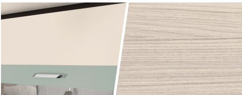
+ Wood décor Tindari Bora