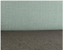
+ Upholstery Timor