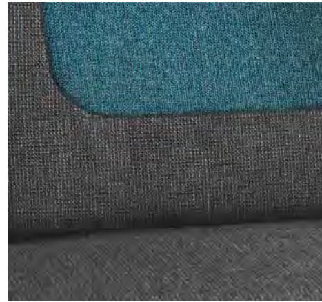
Salerno (optional Comfort Package)