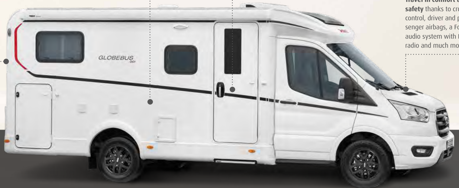
Travel in comfort and safety thanks to cruise control, driver and passenger airbags, a Ford audio system with DAB+ radio and much more