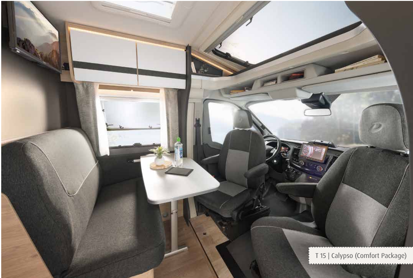
T 15 | Calypso (Comfort Package)