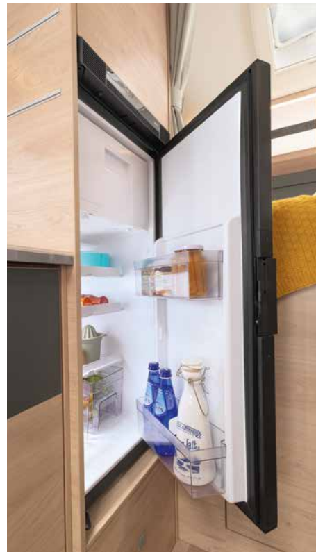
An 84-litre compressor fridge with a freezer compartment is fitted as standard. A 149-litre fridge/freezer combination is optionally available.