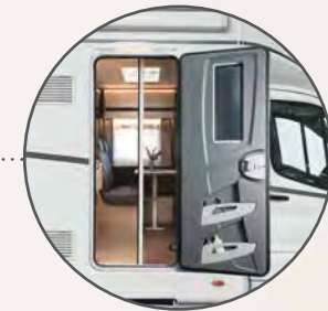
70 cm-wide habitation door with fly-screen blind (T 45)