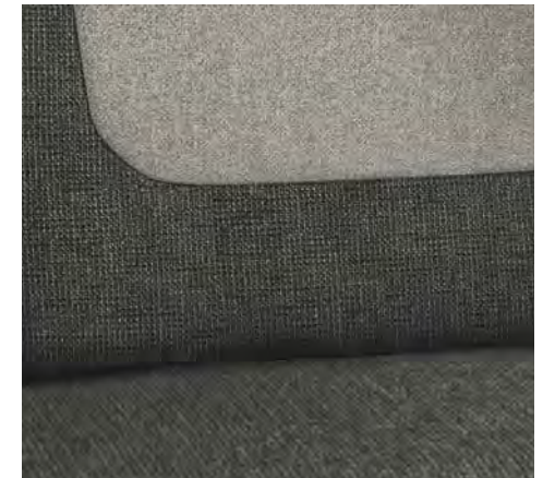
Calypso (optional Comfort Package)