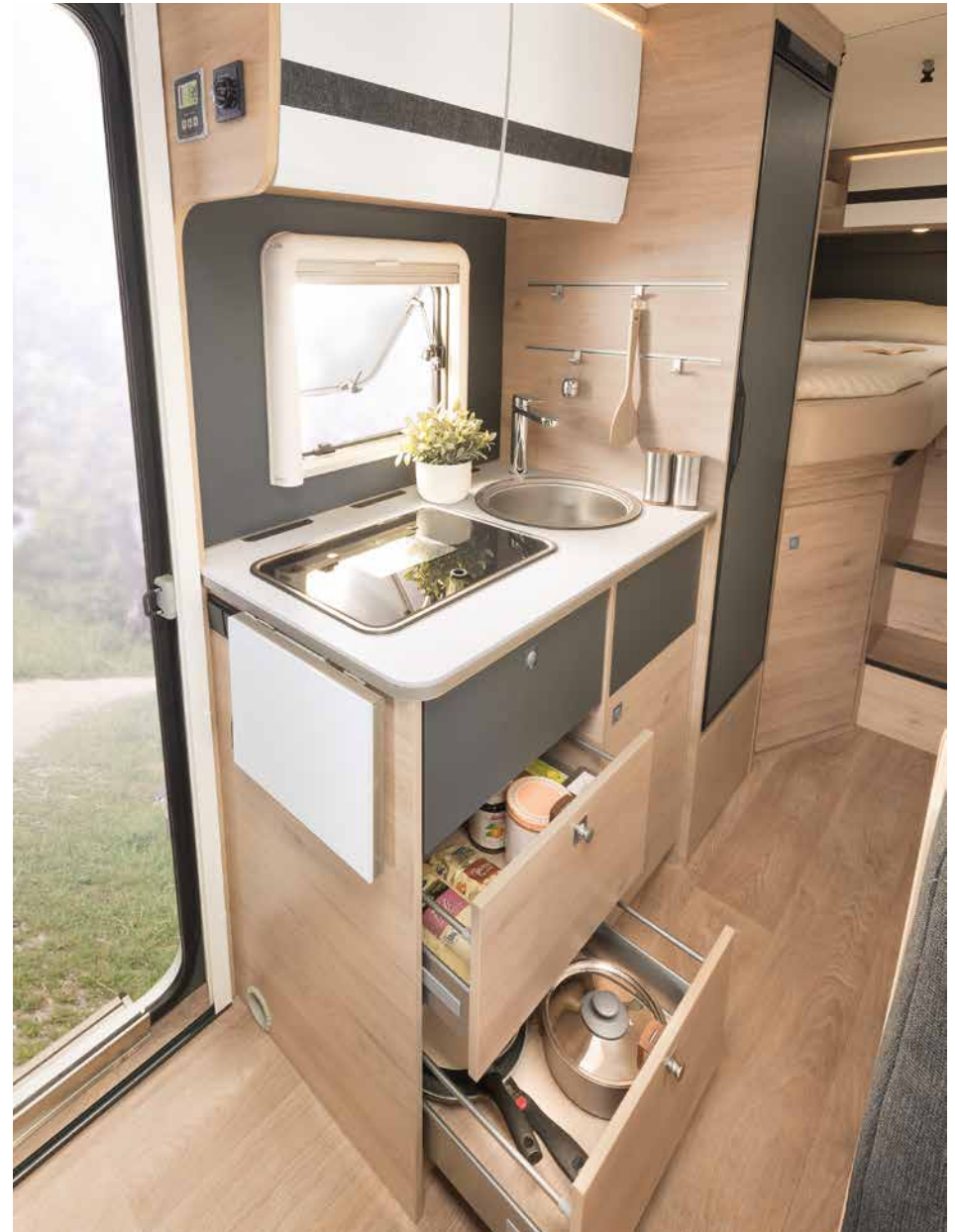
The drawers feature high-quality, sturdy pull-outs and offer plenty of convenient storage space.