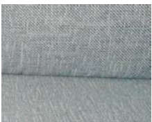
+ Upholstery Drake