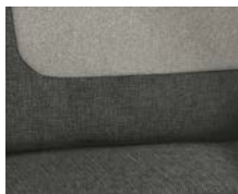
+ Upholstery Calypso incl. driver and passenger seat cover ○