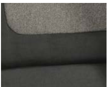
+ Upholstery Ravello