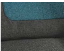
+ Upholstery Salerno incl. driver and front passenger seat cover