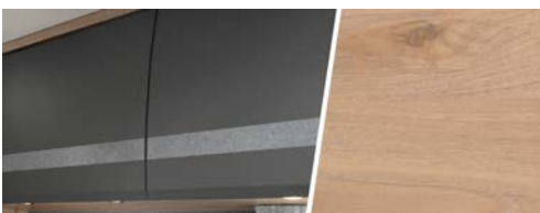
+ Wood décor Noce Nagano