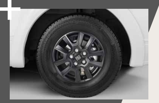
The 16-inch alloy wheels add a touch of automotive style.