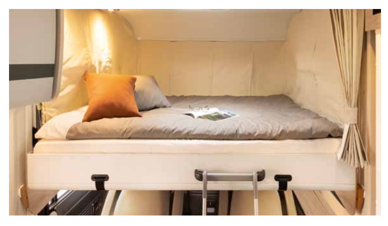
The pull-down bed in the A Class models has a sleeping area with a width of 150 \,\rm cm