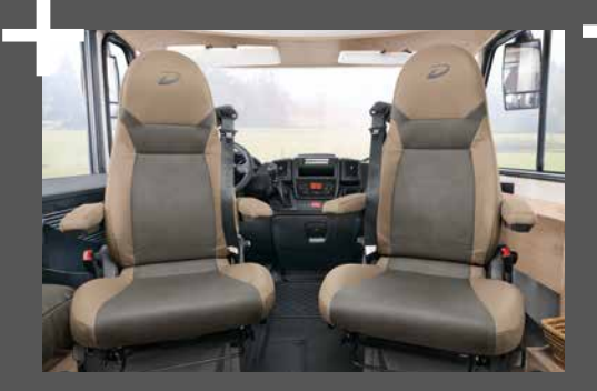
Comfortable captain seats with height/tilt adjustment and upholstered armrests

You can find the full specification for the GLOBEBUS models in the separate technical information or at www.dethleffs.com/globebus