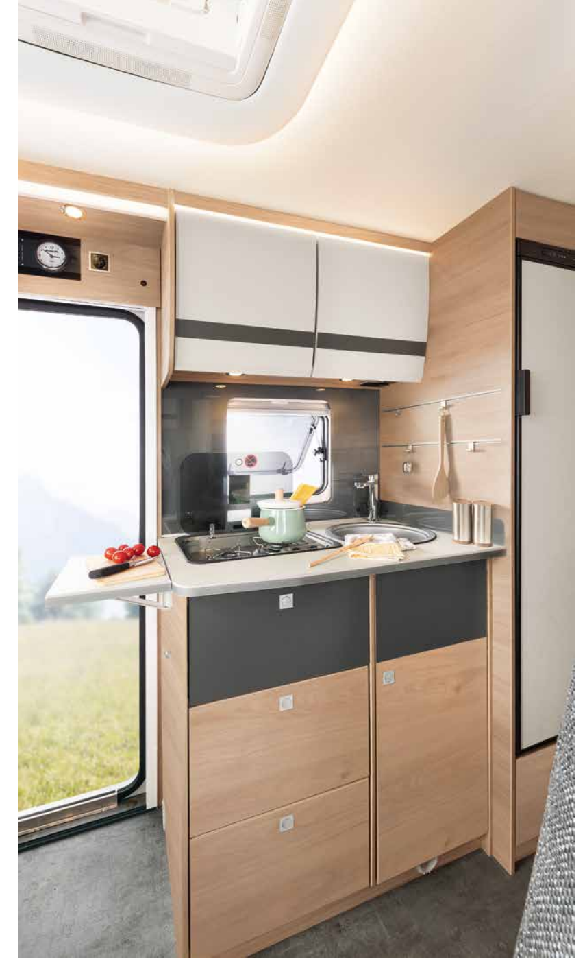
Compact, yet packed everything you need – fully equipped kitchen with hot-water system, gas cooker, large drawers and fridge \ast \downarrow 6