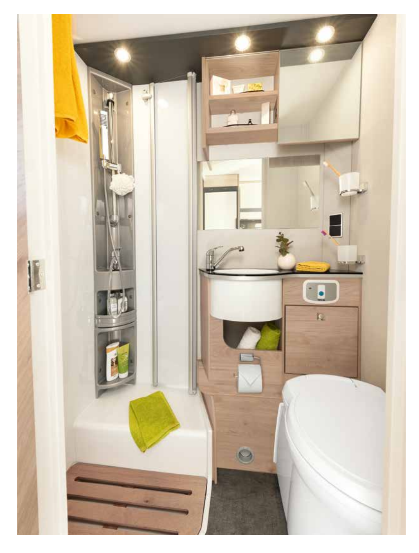
The I 6 comes with a roomy, separate shower, an easy-to-access sink and lots of storage space \ast \mid 6