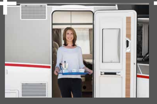
70 cm wide habitation door (I 6 / I 4) with window and fly-screen blind