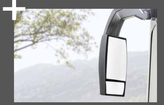
Coach-style mirrors for an optimal field of vision