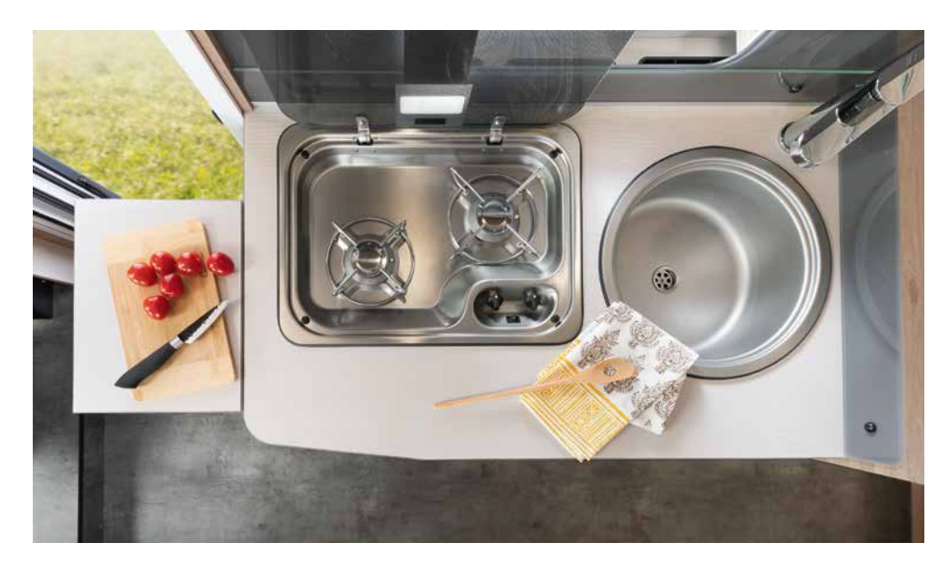
The worktop extension can be folded away very quickly when it is not needed. The 2-burner gas hob features an integrated piezo ignition. \cdot \mid 6

There is enough space in the drawers and the kitchen base cabinet for all your supplies and utensils. Your crockery also has a home in the overhead lockers. * + 6