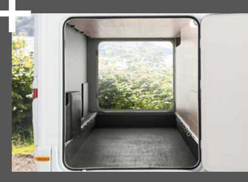
Large rear garages with access from both sides and smooth-running twist/quick-release latches.