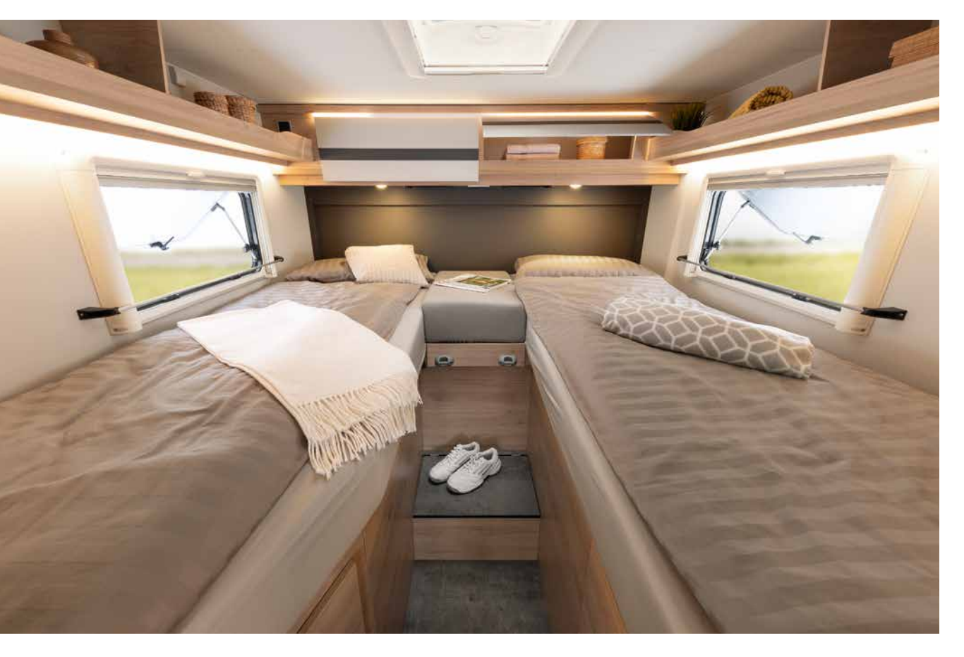
The practical single beds have a length of 195 cm. They can be quickly converted into a 200 x 155 cm sleeping area (option) \frac{1}{4}