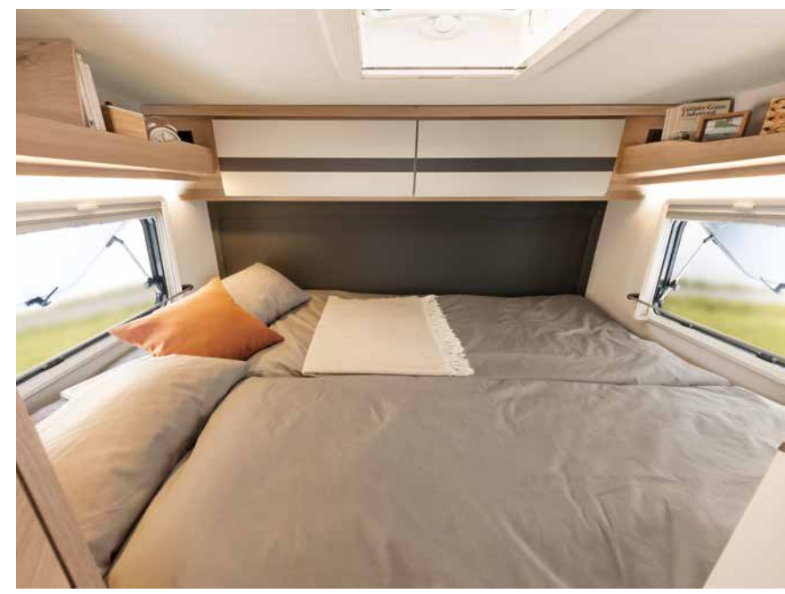
The transverse double bed offers a generous 200 x 145 cm sleeping area. Like the single beds, it ensures perfect sleeping comfort thanks to a 150 mm-thick 7-zone mattress made of climate-regulating material * \pm 1