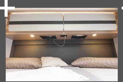
The practical tensioning nets in the rear secure your cell phone and glasses at night, and a charging socket is right next to them.

Leather steering wheel with controls, cruise control, cab air-conditioning, driver and passenger airbags and much more are included as standard