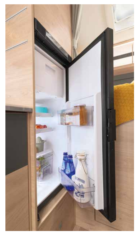
An 84-litre compressor fridge with a freezer compartment is fitted as standard. A 149-litre fridge/ freezer combination is optionally available.