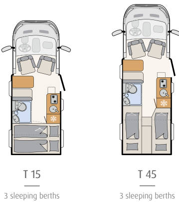
3 sleeping berths