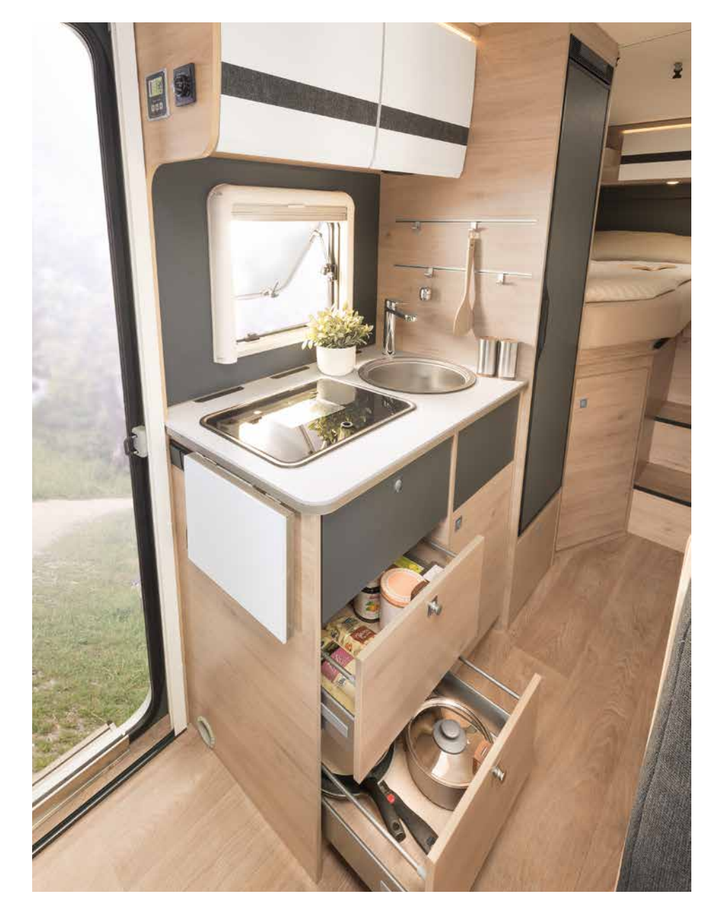
The drawers feature high-quality, sturdy pull-outs and offer plenty of convenient storage space.