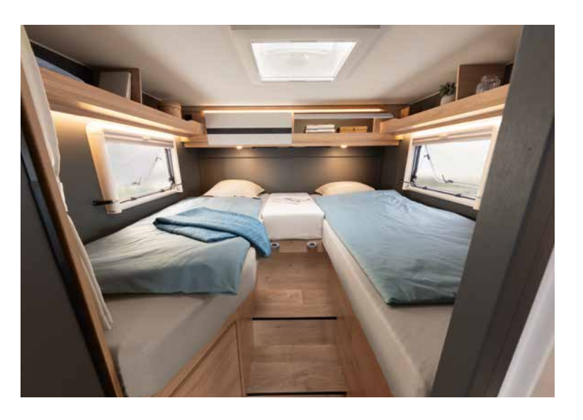
The T 15's overall length of just 598 cm is only made possible by the transversely installed double bed. Nevertheless, it offers a generous sleeping surface of 198 x 137–132 cm. The combination of closed overhead lockers and open shelves creates plenty of easily accessible storage space, which is further extended by the large storage compartments under the folding French bed. *T 15

Optionally, the comfortable and generously sized (201 x 80 and 193 x 75 cm) single beds can be converted into a large sleeping area in a few easy steps, which extends across the entire width of the vehicle. *T 45