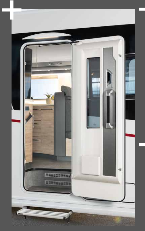
70 cm-wide door with window, central locking system and electric closing aid

A complete overview with detailed information can be found at: www.dethleffs.com/xli