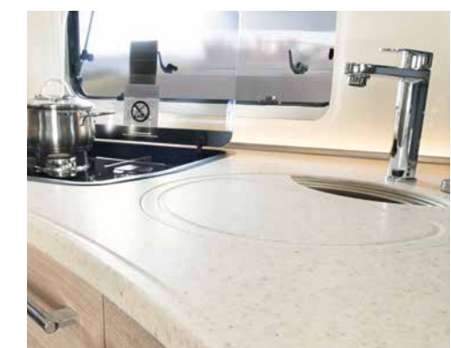
A haptic delight: the easy-care mineral worktop