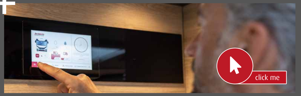
Dethleffs Connect – your digital control centre! View important vehicle data and control relevant consumers such as the fridge, heating or air-conditioning system via touchscreens on the dashboard, in the living room – or via the smartphone app