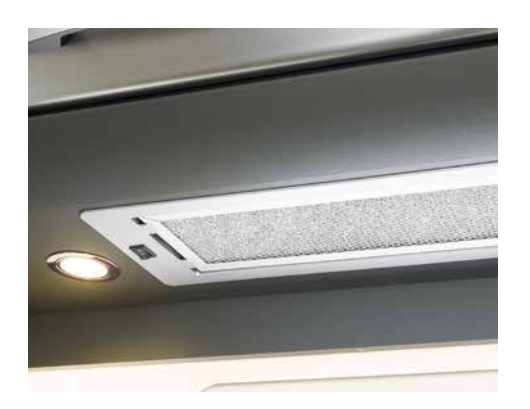
Clear the air: powerful cooker-hood extractor with draught stopper (option)