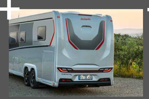
Stylish GRP rear section with first-class insulation and elegantly integrated reversing camera and third brake light