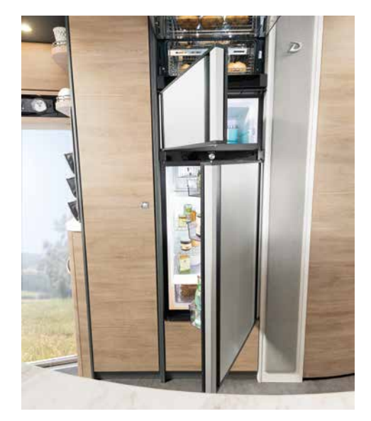
Optionally available: 177-litre fridge / freezer combination with oven. The doors can even be opened in either direction thanks to a double hinge!