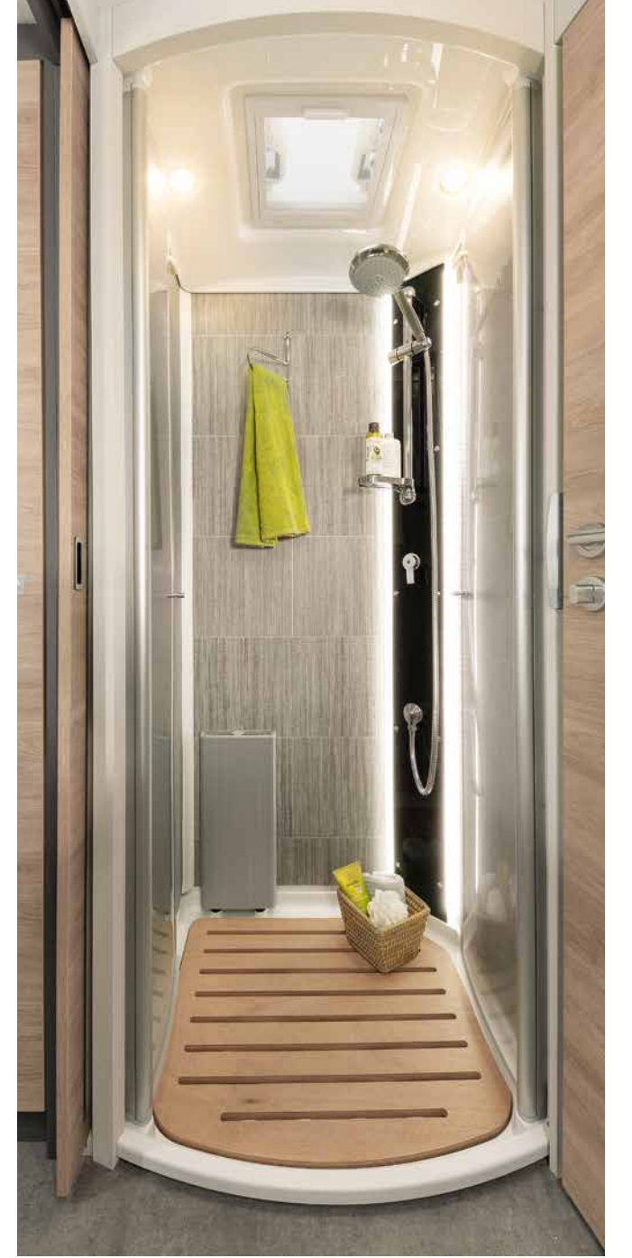
There is also plenty of space in the separate shower with backlit fittings.