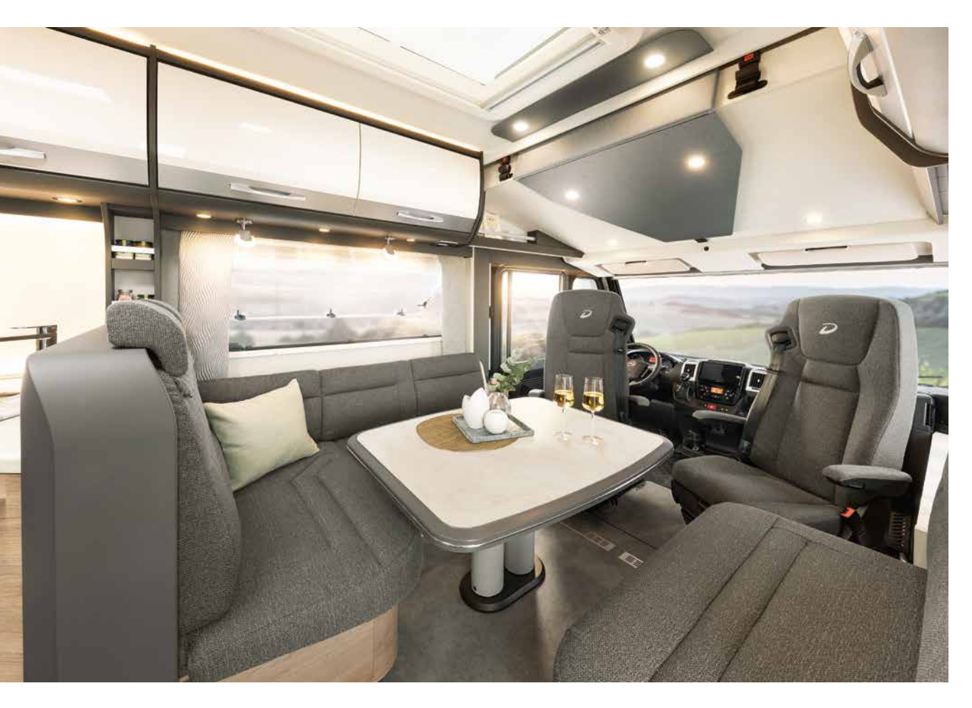
Need an additional seat for the journey? A sturdy folding seat with 3-point safety belt is already integrated into the optional transverse seating. • I 7850-2 EB | Melia