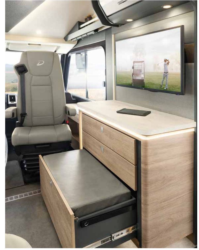
The attractive sideboard is a multifunctional all-rounder that offers additional, extremely practical storage space. The bottom drawer with upholstered top can be used as a foot rest, step or an additional seat for guests.