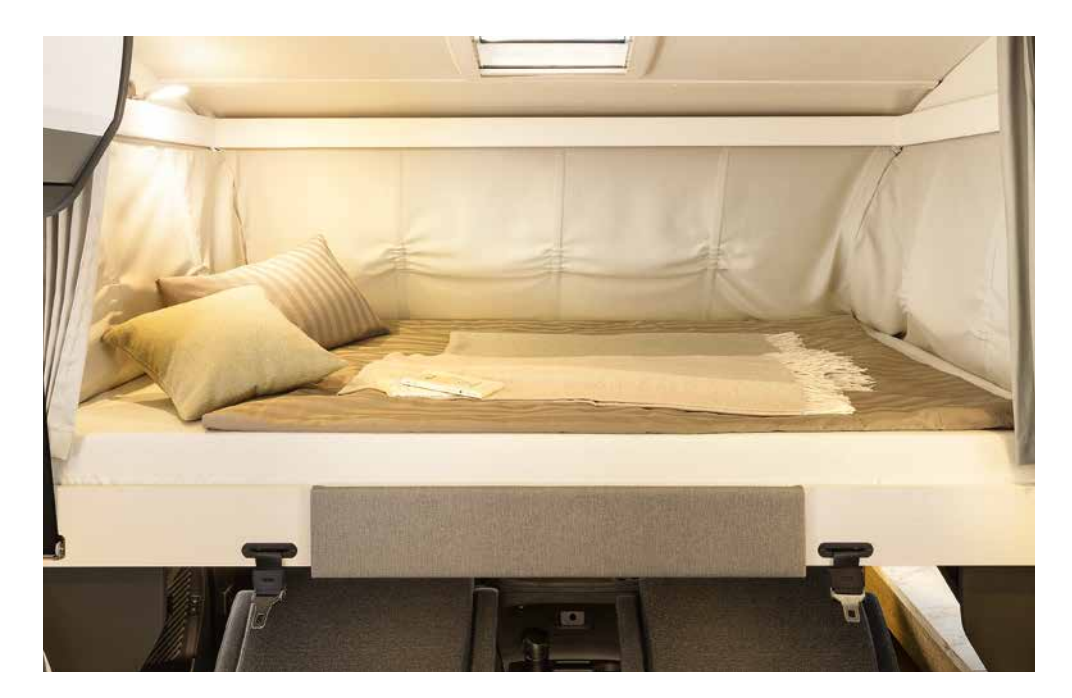
Electrically adjustable pull-down bed (200 x 150 cm sleeping area) with high-quality mattress

This is peak comfort. The 160 cm-wide queen bed is accessible from three sides. On the left and right, two large wardrobes offer additional storage space