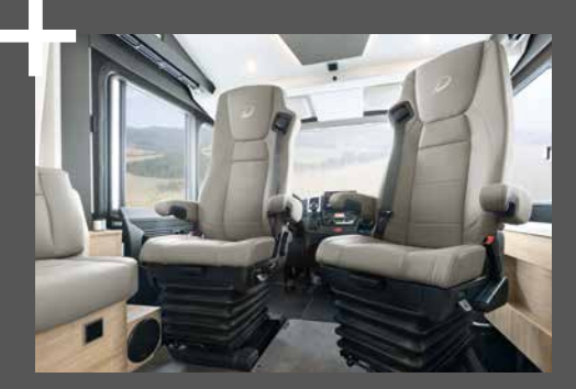
Travel first class thanks to shockabsorbing hydraulic seats with a heated and ventilated seat surface (option)