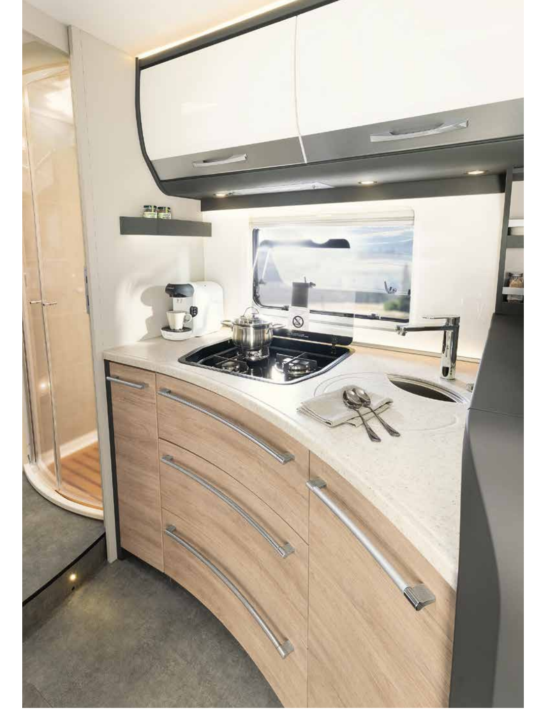
Plenty of cooking fun! The GourmetPlus kitchen brings together everything you need to cook up a storm. With plenty of elbow room and storage space to boot! The drawers are automatically locked when the engine is started

Ideal storage: the large apothecary-style drawer