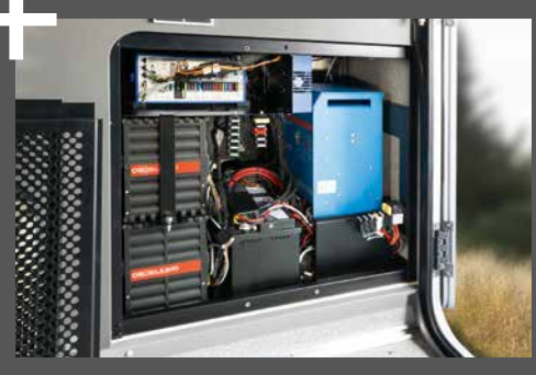
Enjoy prolonged self-sufficiency thanks to the latest lithium-ion technology with 1600 W or 3000 W power output (option)