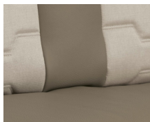
+ Upholstery Nubia