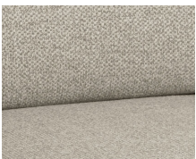
+ Upholstery Kari