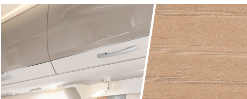
+ Wood décor Noce Nagano