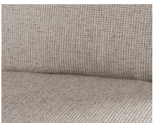
+ Upholstery Heron (partial textile-leather) ○