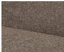
+ Upholstery Yoko