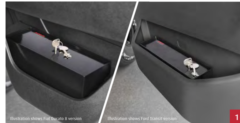
Illustration shows Fiat Ducato 8 version

You can find more exciting offers and promotions online at www.dethleffs-original-zubehoer.com