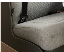
+ Upholstery Scandi