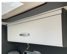
+ Wood décor Amberes Oak ○